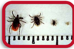
MN Department of Health www.health.state.mn.us/divs/idepc/dtopics/tick_borne/ticks

Lyme disease is transmitted via bites of infected nymphal and adult female blacklegged ticks (adult males do not feed). Nymphal bites appear to cause more disease than adult bites. Female and male adults, nymphal and larval ticks are shown here. While all are small, the size differential between the adult female and nymph is striking.